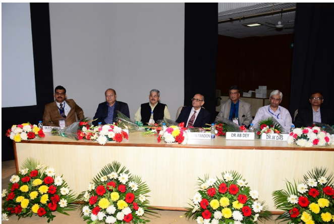
Left: Inauguration Ceremony by Padma Bhushan Dr PN Tandon.